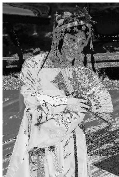
A member of the Zhejiang Butterfly Performing Troupe which performed at the Opening Ceremony of the Confucius Institute